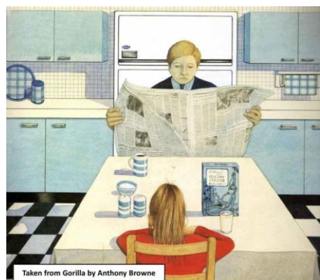
Taken from Gorilla by Anthony Browne

Remember, a little reading goes a long way! (even if it is only a page)